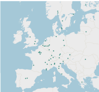
Map showing EBRAINS 2.0 consortium partners across Europe. Created using OpenMapTiles.

Management, Coordination and Communication